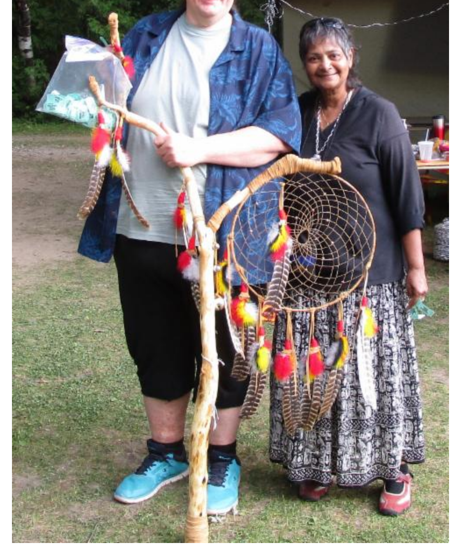
Border Crossing - to the Wakefield Market's Aboriginal Artist Harvest Moon even